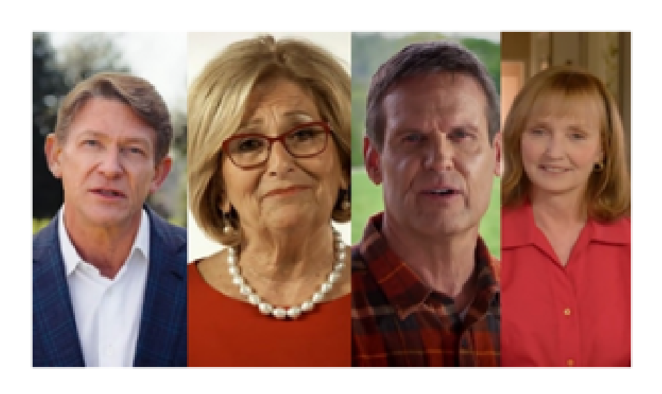
TN GOP Governor's Primary

The terrific candidate I was campaigning for told me that voter registration has always been low. He was our former five-term county sheriff and had campaigned throughout the entire Knox County of 500,000 people as well as surrounding counties many times. Those with money and stature don't feel they need to vote, they have everything they need and their apathy toward our Republic and our right to vote is indefensible. In my neighborhood of 21 homes, only seven homes are registered to vote, and a few of those homes are Democrats.