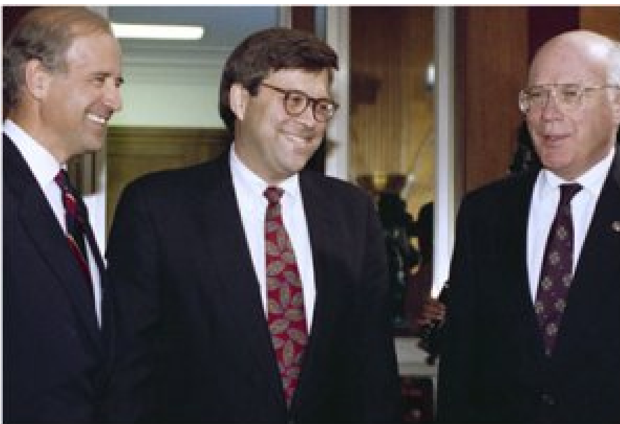
Attorney General nominee William Barr (center) chats with then-Sen. Joe Biden and Sen. Patrick Leahy, D-Vt., before Barr's hearing on Nov. 12, 1993.

Barr expressed his support for gun control measures as well as confiscation during the hearings in 1991 for his first time as Attorney General for President George H.W. Bush. He is widely considered to be the author of PL 101-647, The Crime Control Act of 1990.