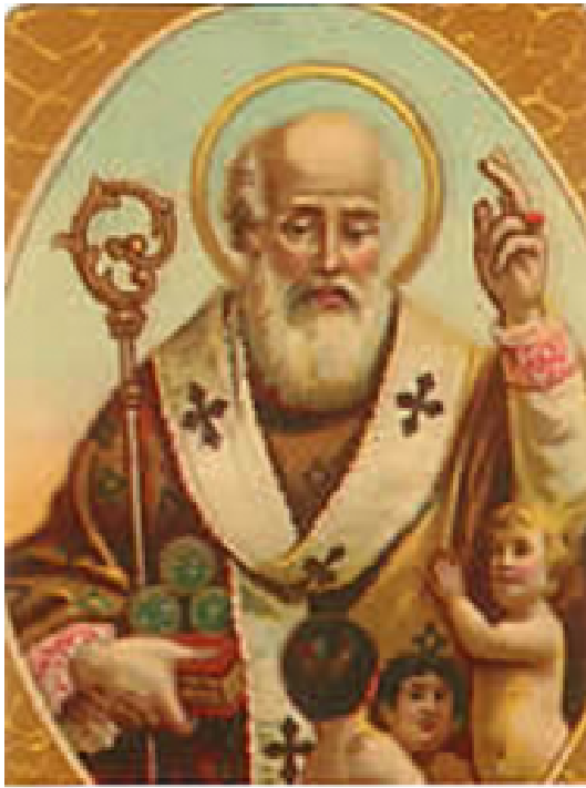
S. Nicola di Bari

Approximately 200 years after the birth of Christ, a meeting of the elders of a little church in Myra, Turkey had just been called to order. They needed to appoint a bishop but no fitting candidate could be found. So great was the need that they decided to pray.