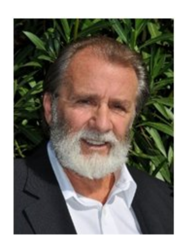
Part 2 of 3 - The Unabomber Case

Note: After others read Part 1 of my story I was surprised that so many people responded. All of the Emails I received were negatively written against the FBI. There was not one person that wrote to me in a negative way. Once again here is my E-mail address if you wish to respond. It is unfrend1@yahoo.com