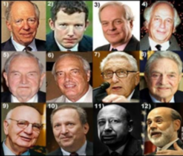
Heads of The World Order