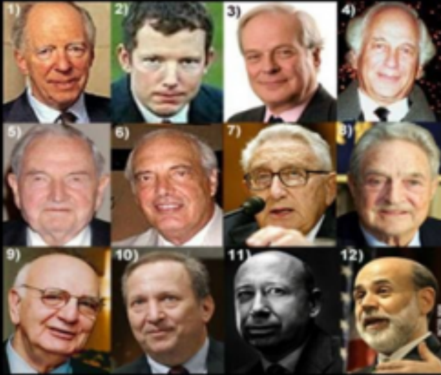
Heds of The World Order