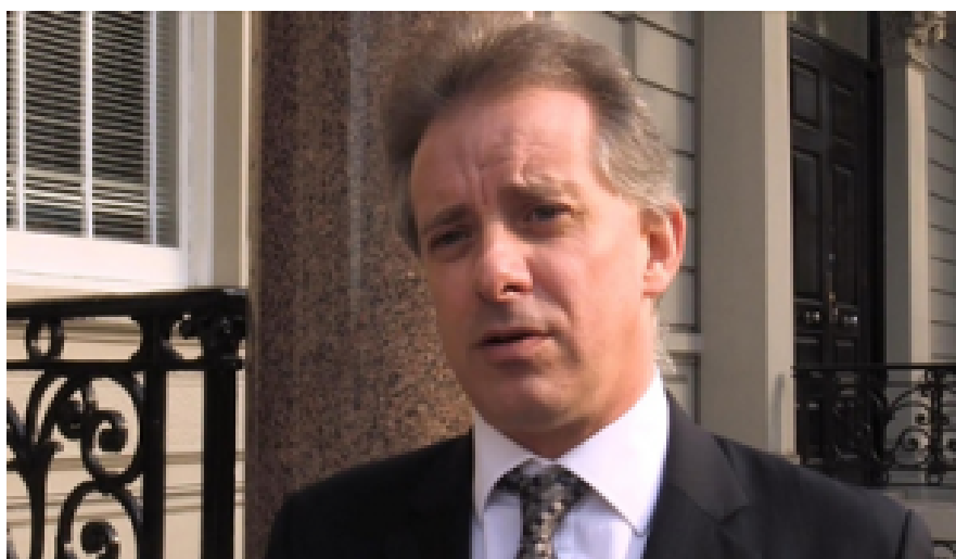
Christopher Steele’s Written Declaration