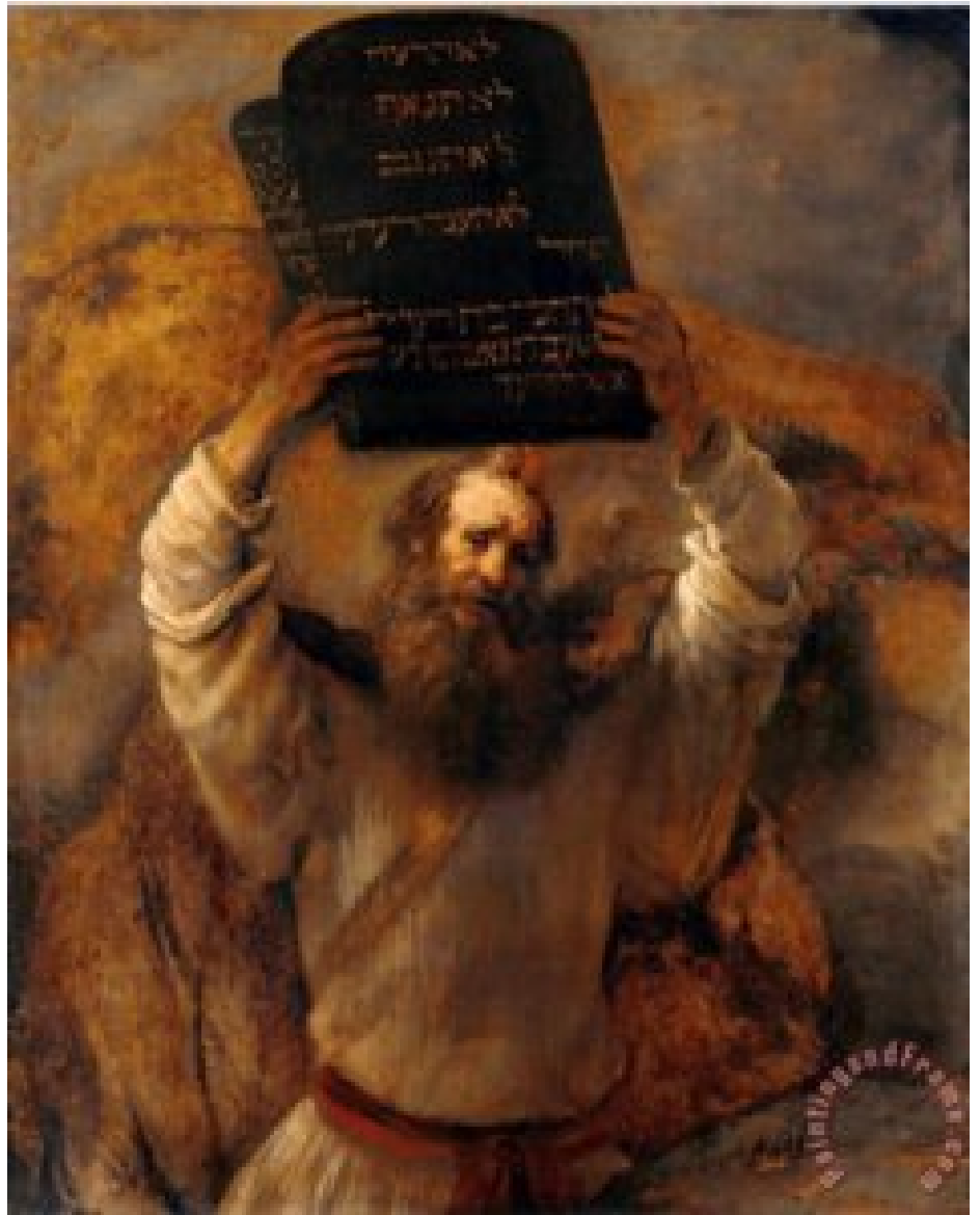
Moses with the Tablets of the Law, oil on canvas, by Rembrandt Van Rijn