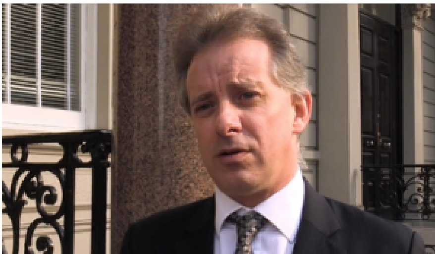
Christopher Steele’s Written Declaration