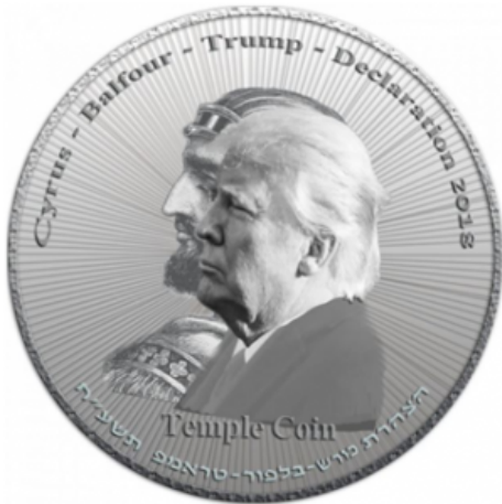
Temple coin bearing the images of Donald Trump and King Cyrus recently minted by the nascent Sanhedrin and the Mikdash (Temple) Educational Center to honor President Trump for his recognition of Jerusalem as the capitol of Israel

our God, rejected His many warnings, and ultimately suffered the just judgment.