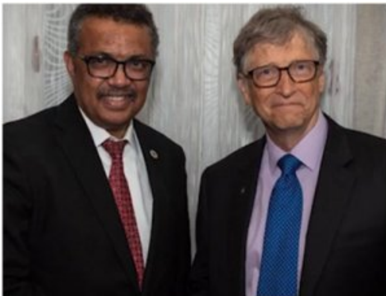
WHO, CDC, NIH and Dr. Fauci

Chicago's former mayor, Democrat Rahm Emanuel said, "Never let a good crisis go to waste." The democrats are using this virus as their last chance to oust President Trump in November. The soaring economy he created is temporarily in the tank, and 401k's have lost 25 to 30 percent of their previous gains. Since the Democrats own the banks and the media, they are utilizing everything they can to tear down President Trump's legacy. They are absolutely thrilled with the decimation our country is experiencing from Covid-19, and they are blaming our President just like Red China. And now the increasingly unstable media is demanding blackouts of Trump's Covid-19 briefings.