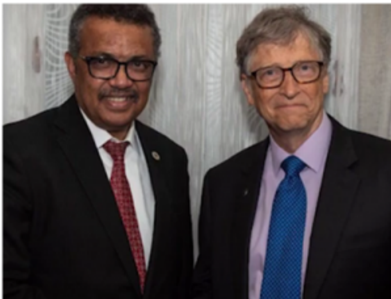
WHO, CDC, NIH and Dr. Fauci

Chicago's former mayor, Democrat Rahm Emanuel said, "Never let a good crisis go to waste." The democrats are using this virus as their last chance to oust President Trump in November. The soaring economy he created is temporarily in the tank, and 401k's have lost 25 to 30 percent of their previous gains. Since the Democrats own the banks and the media, they are utilizing everything they can to tear down President Trump's legacy. They are absolutely thrilled with the decimation our country is experiencing from Covid-19, and they are blaming our President just like Red China. And now the increasingly unstable media is demanding blackouts of Trump's Covid-19 briefings.