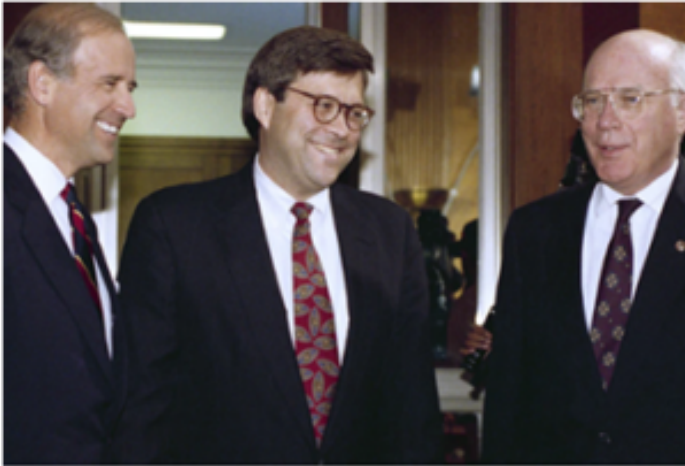
Attorney General nominee William Barr (center) chats with then-Sen. Joe Biden and Sen. Patrick Leahy, D-Vt., before Barr's hearing on Nov. 12, 1991.

Barr expressed his support for gun control measures as well as confiscation during the hearings in 1991 for his first time as Attorney General for President George H.W. Bush. He is widely considered to be the author of PL 101-647, The Crime Control Act of 1990 .