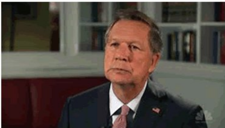
Ohio Governor John Kasich

I am concerned for the security of our great Nation; not so much because of any threat from without, but because of the insidious forces working from within. –General Douglas MacArthur