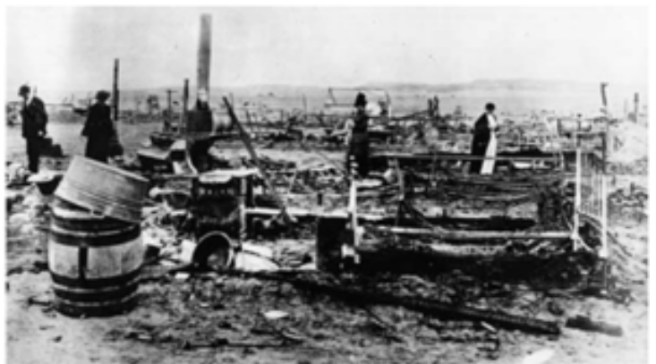
Ruins of the Ludlow camp in Colorado, 1914.

It took place at the mines of the Rockefeller-owned Colorado Fuel and Iron Company (CFI). The face-off raged for 14 hours, during which the miners' tent colony was pelted with 1200 rounds of machine gun fire and ultimately torched by