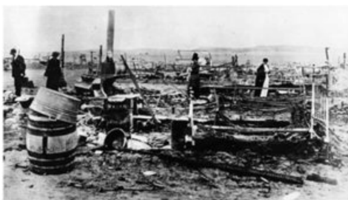
Ruins of the Ludlow camp in Colorado, 1914.

It took place at the mines of the Rockefeller-owned Colorado Fuel and Iron Company (CFI). The face-off raged for 14 hours, during which the miners' tent colony was pelted with 1200 rounds of machine gun fire and ultimately torched by