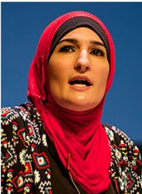
Pro-Palestinian Islamic Heads the Women's March