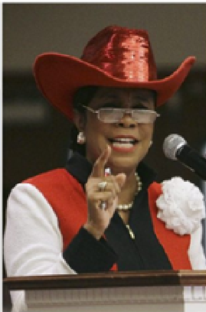
General Kelly Stunned at Wilson's Comments