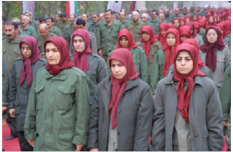
Mojahedin-e Khalq cultists

According to Human Rights Watch who interviewed several former MEK members, the organization is a cult that has kept its members virtually imprisoned in a compound in Iraq and controlled them psychologically. They eliminated anyone who expressed their intent to leave.