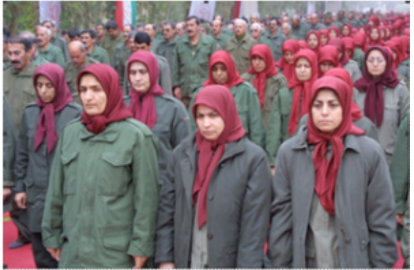
Mojahedin-e Khalq cultists

According to Human Rights Watch who interviewed several former MEK members, the organization is a cult that has kept its members virtually imprisoned in a compound in Iraq and controlled them psychologically. They eliminated anyone who expressed their intent to leave.