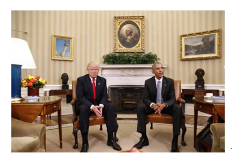
Trump Meets with Obama

infects the body politic so that it can no longer resist. A murderer is less to fear."