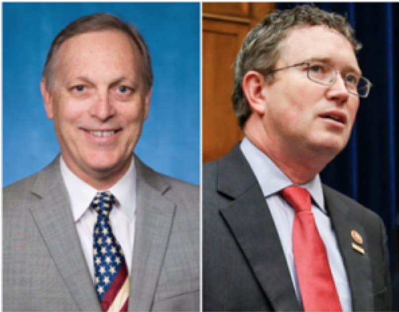
Congressmen Andy Biggs and Thomas Massie

Congressman Andy Biggs (R-AZ) was right there with Massie. Both of them knew it was important for Americans to know how their representatives voted on this bill.