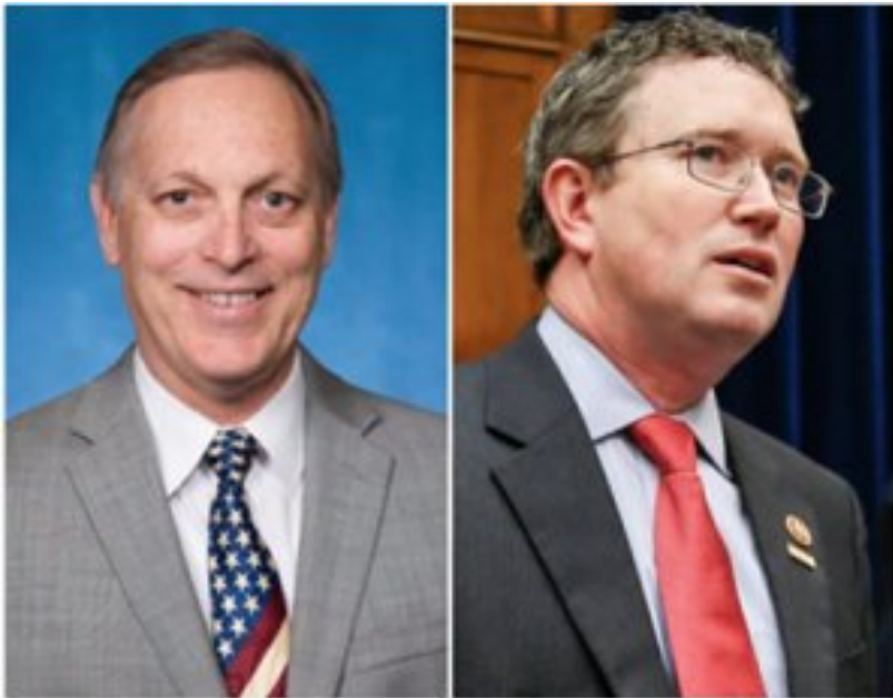
Congressmen Andy Biggs and Thomas Massie

Congressman Andy Biggs (R-AZ) was right there with Massie. Both of them knew it was important for Americans to know how their representatives voted on this bill.