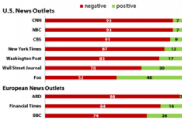
tone of news coverage (percentage of news reports with positive or negative tone)