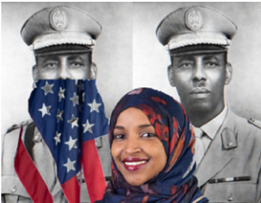
Ilhan's Father, Top Propagandist in Somalia