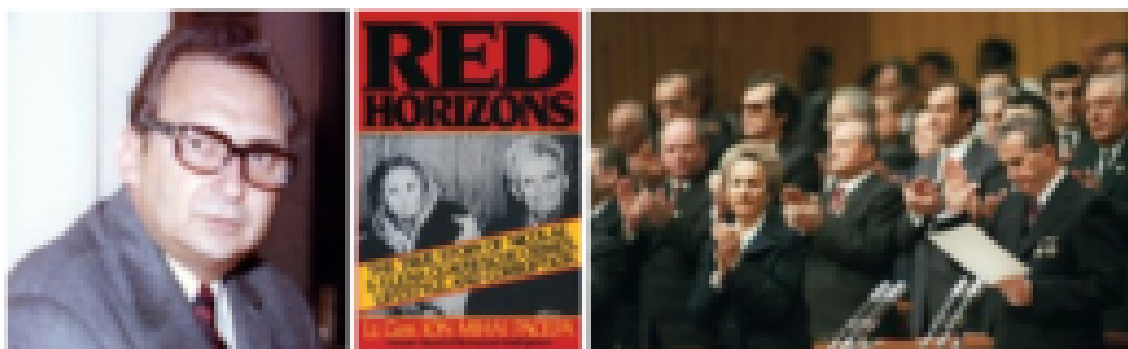
Lt. Gen. Ion Mihai Pacepa, Red Horizons , Washington, D.C.: Regnery Gateway Press (1987)

According to Andropov, the Islamic world was a waiting petri dish in which we could nurture a virulent strain of America-hatred, grown from the bacterium of Marxist-Leninist thought. Islamic anti-Semitism ran deep. The Muslims had a taste for nationalism, jingoism, and victimology. Their illiterate, oppressed mobs could be whipped up to a fever pitch.