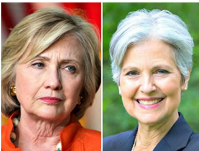
Hillary Joins Stein Recounts

They've lost it folks; their one-sided socialist insanity is showing for the world to see!