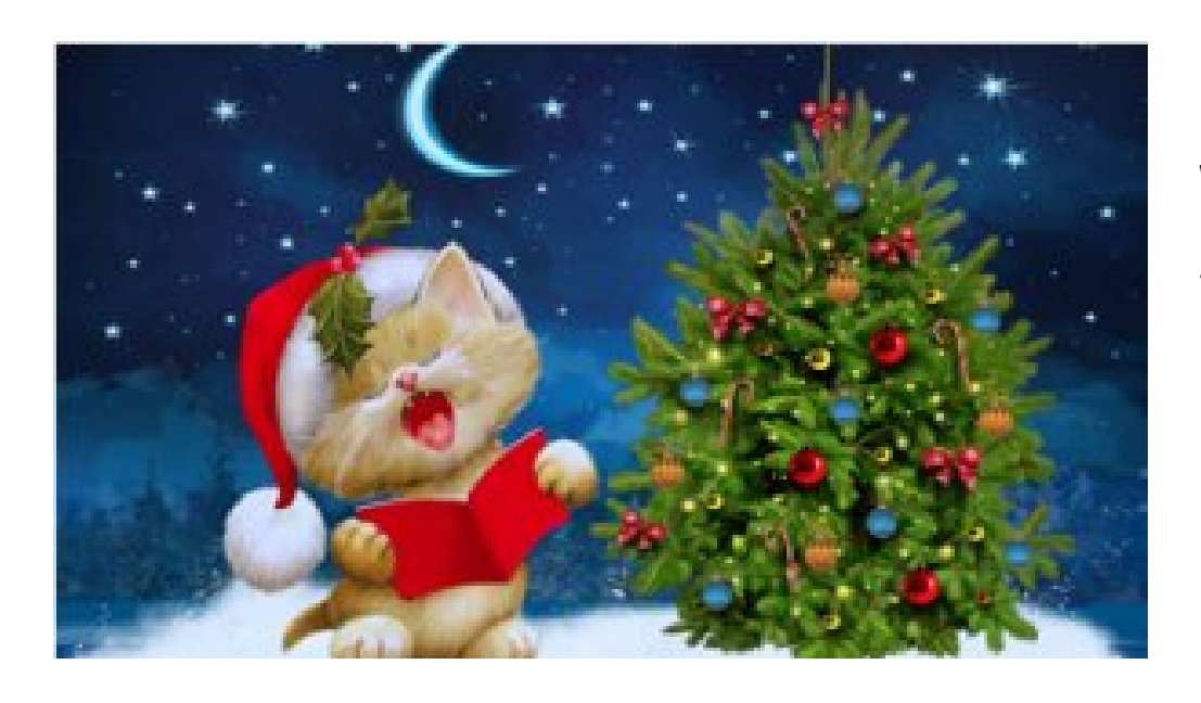
So. I hope everyone had a wonderful, blessed Thanksgiving.

Made it through turkey dinner at the in-laws house. Okay, I just have to throw this one in