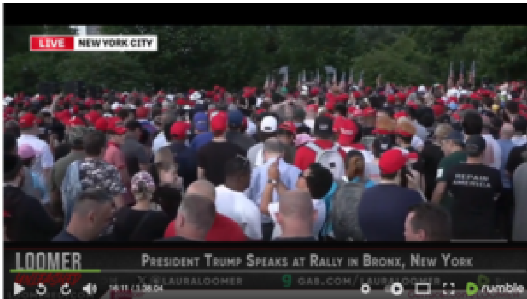
TRUMP IN THE BRONX: LIVE Coverage of President Trump's Bronx, New York Rally

They remember they were better off under Trump!