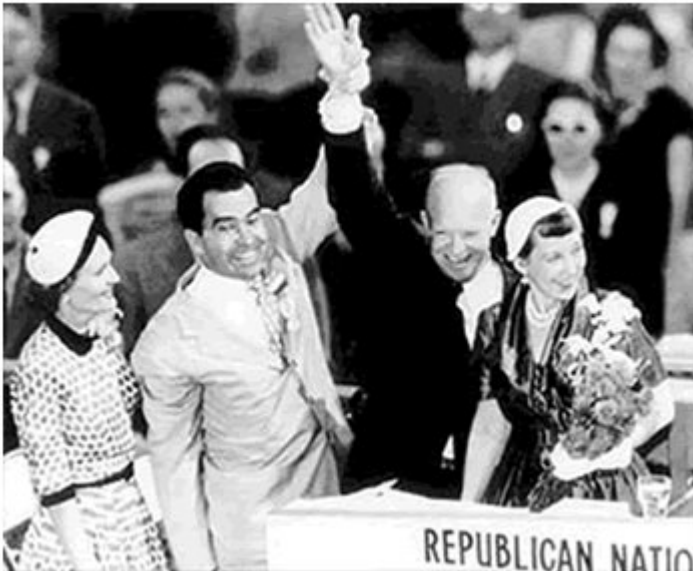
Cruz and Eagle Forum