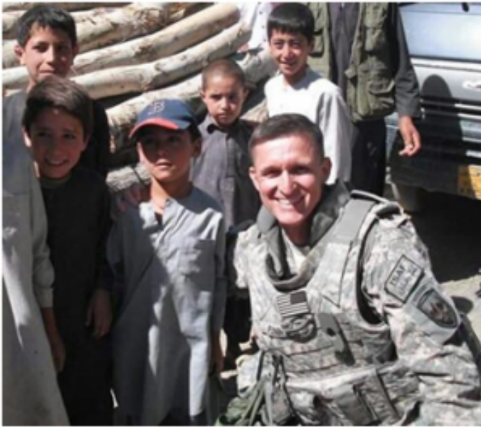
Lt. General Michael T. Flynn (Ret.)

The responsibility of citizens to vote is one that is taken very lightly anymore. While canvassing a neighborhood of hundreds of homes for a local candidate, I was shocked that only about 25 homes had registered Republican voters, and few of them even vote in the most important elections...the primaries.