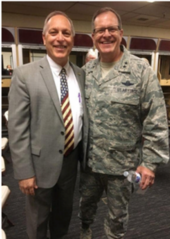
Congressman Andy Biggs

Like General Flynn, he's one of the greats who should still be employed in the arenas they know so well.