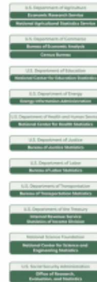
Figure 2. Federal Principal Statistical Agencies (PSAs)

Evidence-based is the new name and broader plan merging all government agencies and departments called an "OPEN GOVERNMENT DATA ACT" HR 4174 that Speaker Ryan and Sen. Murray introduced. ( Source ). Data on the individual is the new mainstay. HIPAA would be rescinded. The cornerstone of the New Managed Economy is the "science" to merge education, health, labor, finance, immigration, etc., all federal departments. Education is the blueprint of data collection to identify and change personality traits of the individual. Data is streaming. It is a river of data. Your government is intent to create the global citizen.