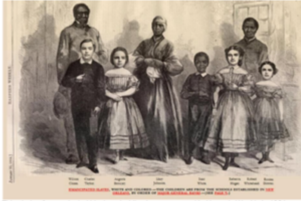
This photo of emancipated black and white slaves appeared in Harper's Weekly in 1864.

provide “breeders” for Virginia. Hopeful migrants were duped into signing as indentured servants, unaware they would become personal property who could be bought, sold, and even gambled away. Transported convicts were paraded for sale like livestock.