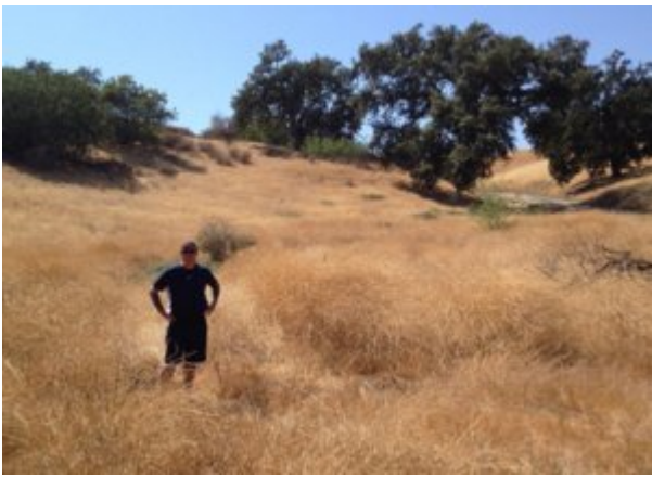
Michael Landon Jr.