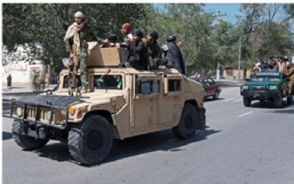
Taliban fighters parade atop vehicles on Aug. 31 as they celebrate the first anniversary of the withdrawal of U.S.-led troops from Afghanistan in Kabul.

Approximately $7 billion of military equipment was left behind in Afghanistan after the US completed its withdrawal from the country in August 2021, according to a congressionally mandated report from the US Department of Defense.