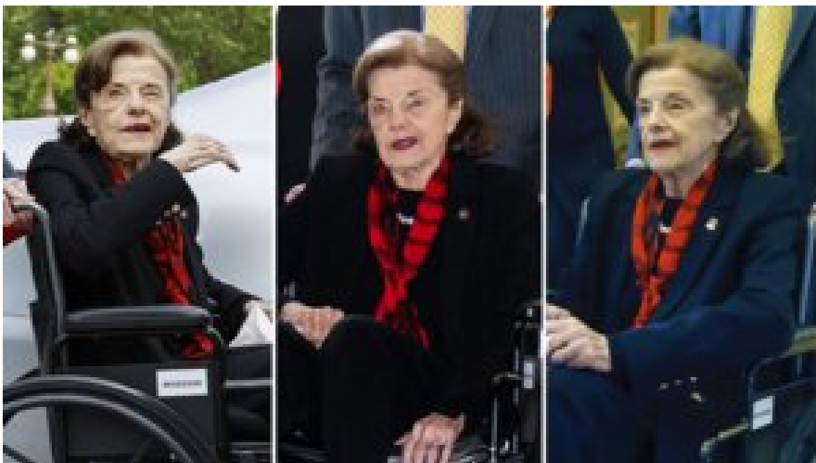
Senator and career crook, Diane Feinstein [D], 89 years old, was hospit

My brother is a double-stroke survivor (six years ago); he almost died before I could get to California as I hold his Medical Power of Attorney. I moved him to my city in 2019. Since he can't drive, I take him to doctor appointments and do his shopping. I know what it's like to be around someone whose suffered a stroke. With good nutrition, mild exercise, important rehab and speech therapy, cutting down the stress factor, stroke victims do very well; others like Fetterman will never fully recover their faculties as the neurological brain damage is too extensive and permanent.